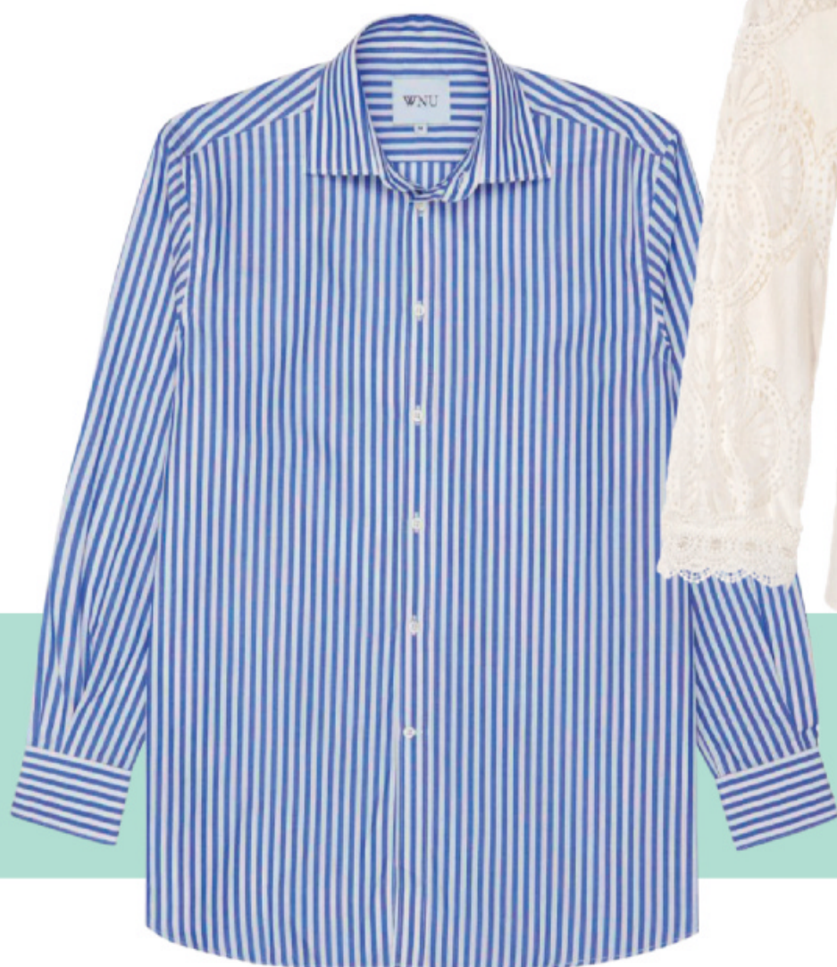
Above: Sézane "Bianca" shirt, $130; sezane.com Left: WNU "The Boyfriend" Poplin shirt, $114; withnothingunderneath.com