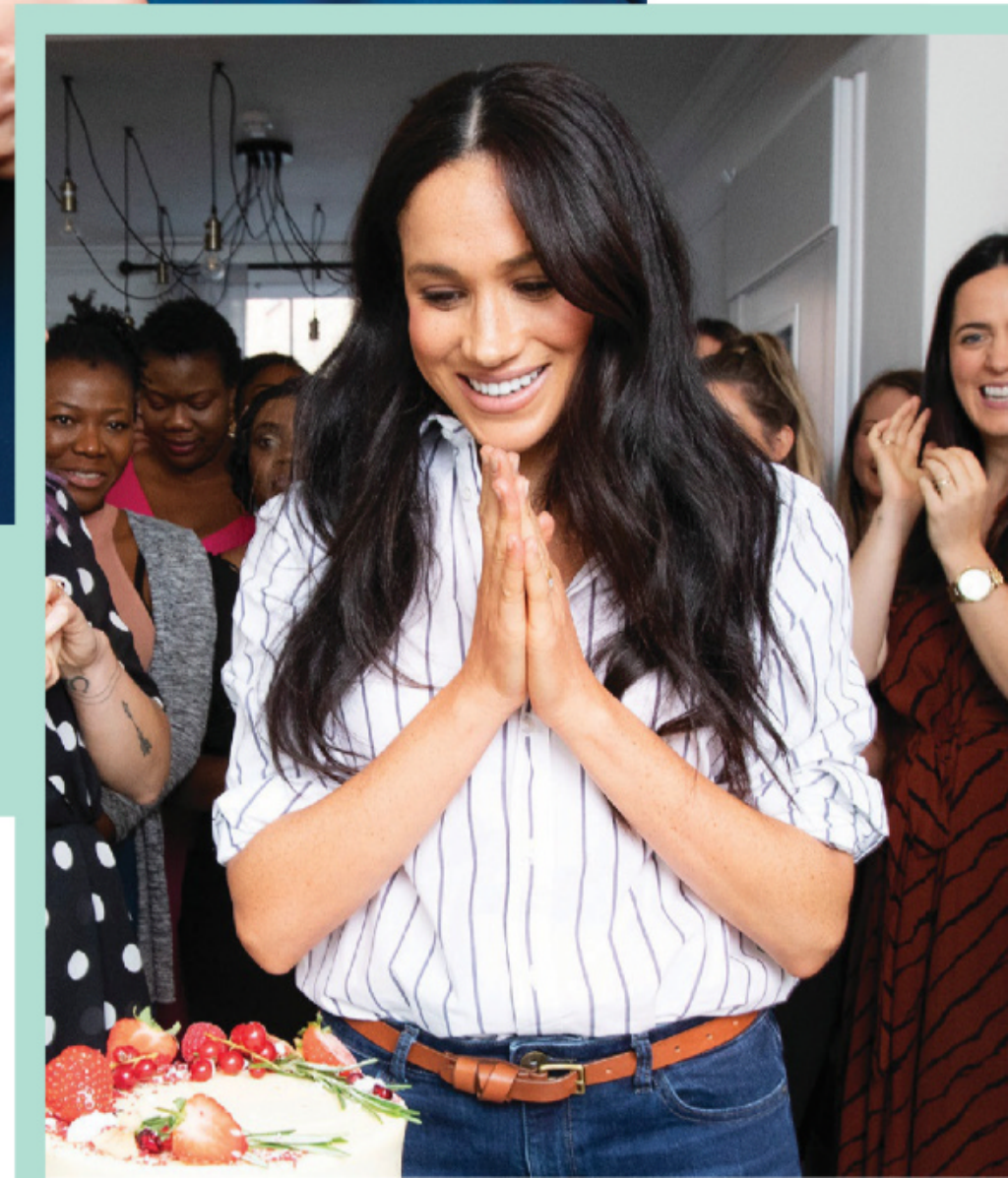
ILLUSTRATION: SAMANTHA HAHN